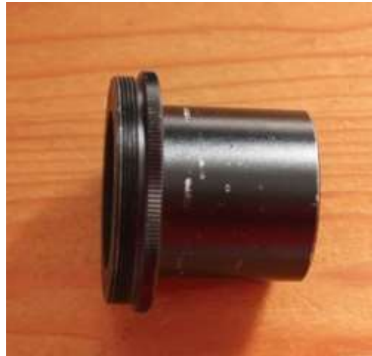
Figure 3 – T Adaptor (1 1/4 “)