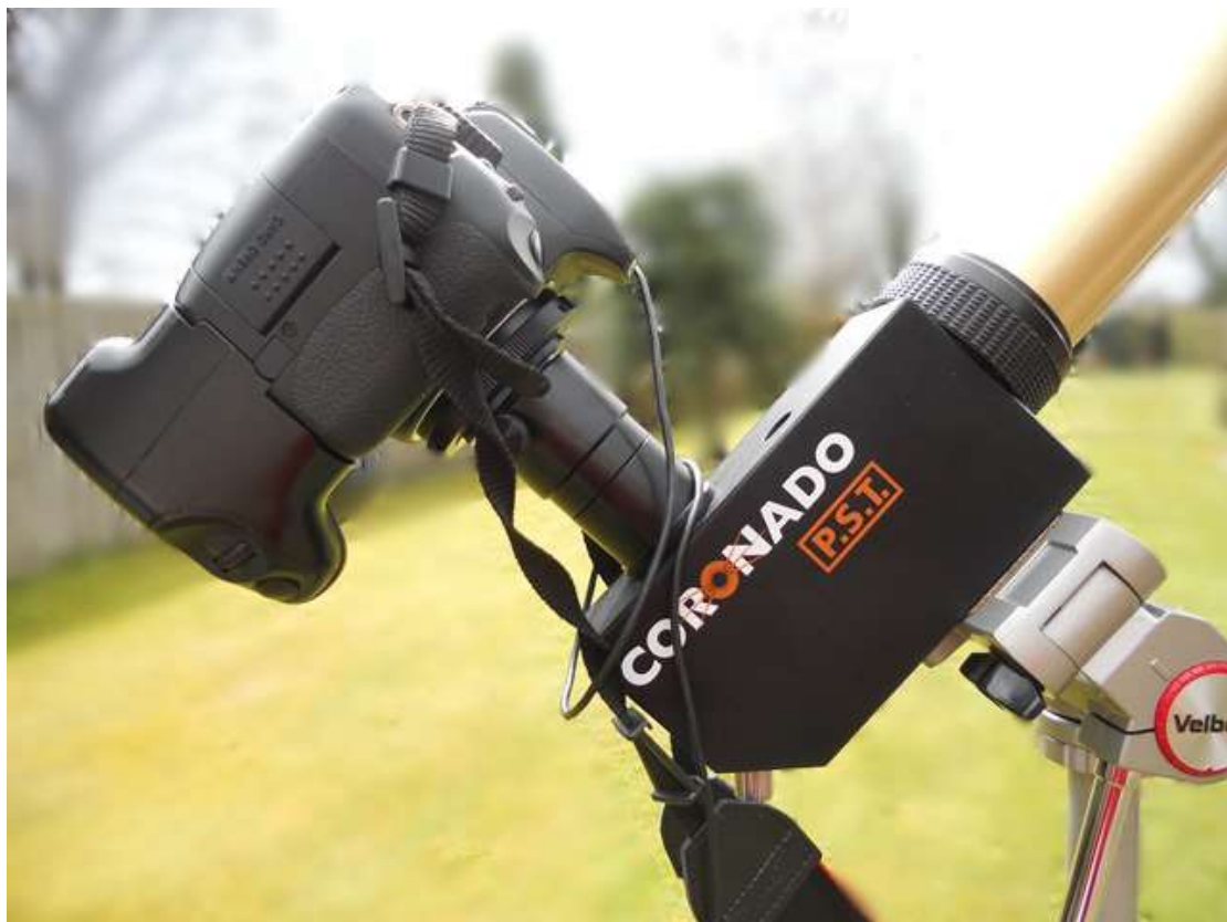
Figure 1 – PST with a Canon DSLR

The final result is shown below (Figure 1). The rest of this document explains how to get there.