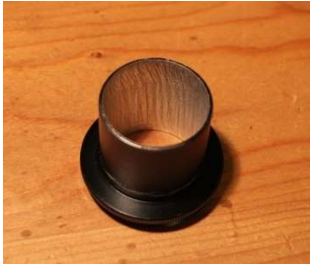
Figure 8 – The finished T adaptor