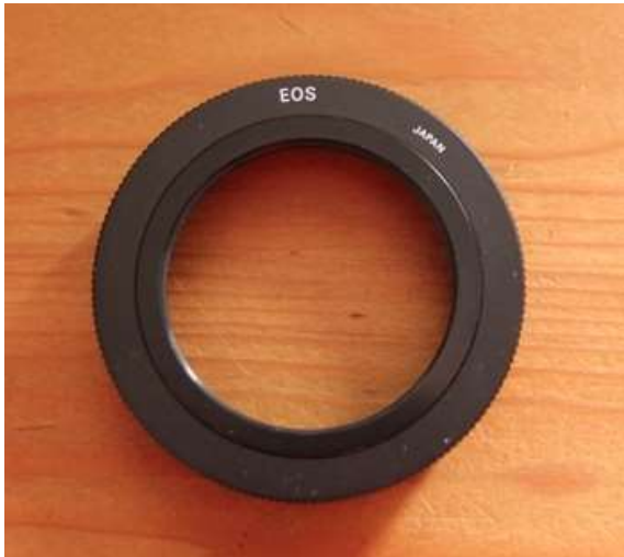
Figure 2 – Camera T Ring

You will need the following three items for making the camera adaptor; these are shown below in Figure 2 to Figure 4: