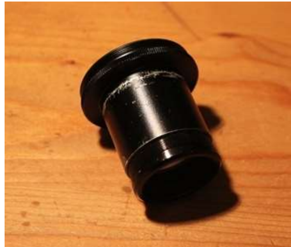
Figure 10 – T adaptor and lens assembled