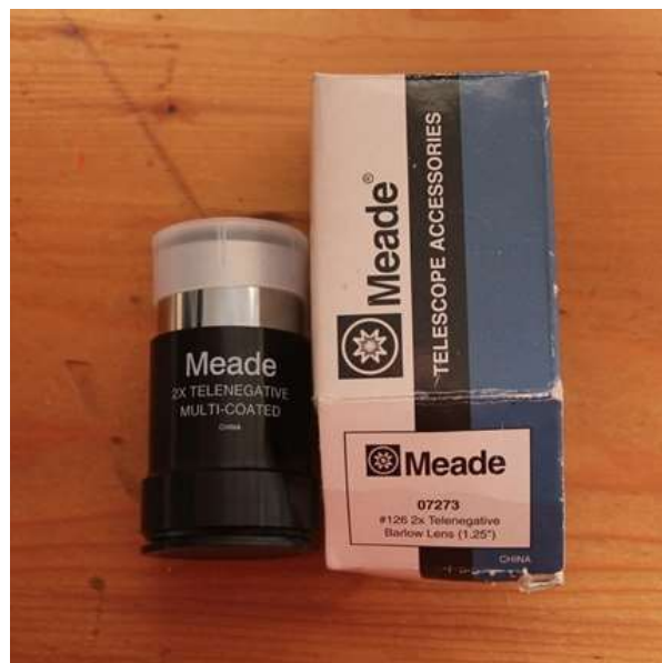
Figure 4 – Meade #126 2x Barlow (1 1/4”)

Note that the method described in this document is only possible due to the construction of the Meade #126 2x Barlow, it will probably not work with other types of Barlow due to different constructions.