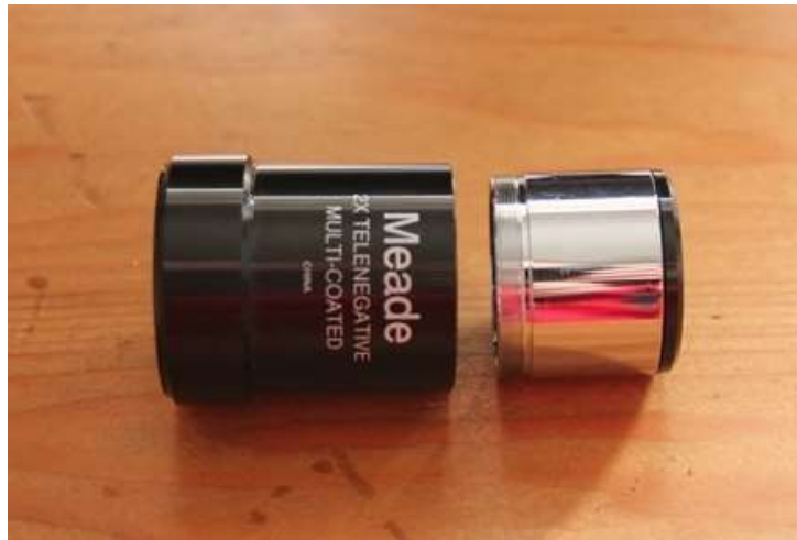
Figure 5 – Unscrew the lens assembly

The first step is to disassemble the Barlow lens; the Meade #126 2x Barlow is made up of three parts which all unscrew from each other as shown below in Figure 5 and Figure 6: