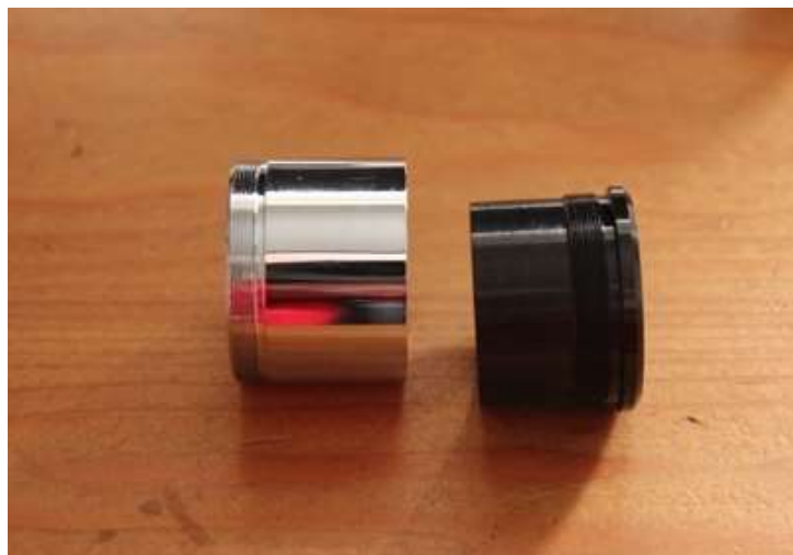
Figure 6 – Unscrew the lens