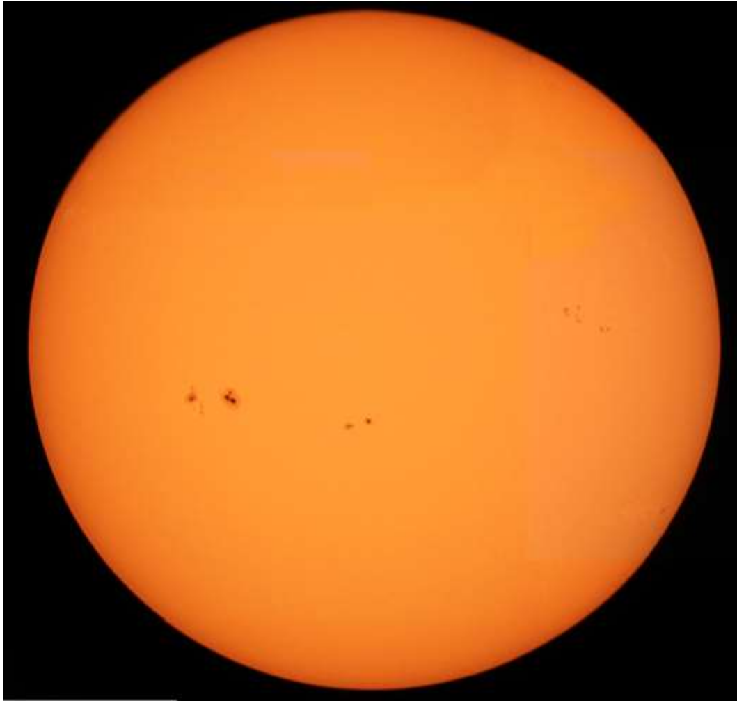
Figure 16 - The Sun in white light– 3 rd May 213