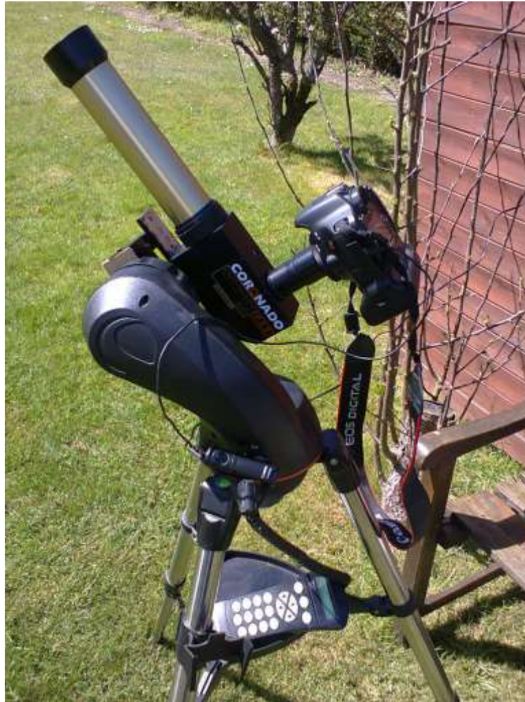
Figure 14 – Imaging Setup