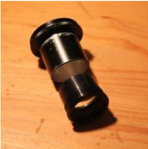
Figure 9 – Slide the Barlow lens into the T adaptor