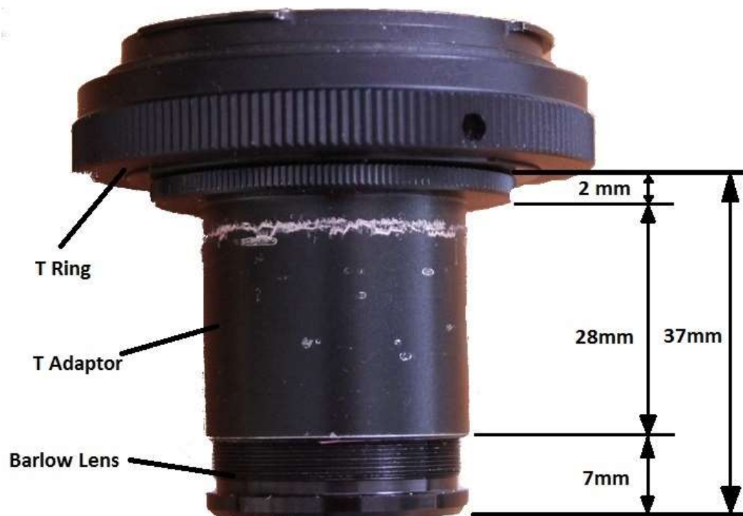
Figure 13 – Finished Adaptor Dimensions

On my PST the eyepiece holder is 35mm deep therefore it is important to get the overall length of the T adaptor from its shoulder plus the Barlow lens as close to (but not more than) 35mm as possible. The image below of my finished adaptor shows an exact measurement of 35mm (37mm with the shoulder) which allows for an exact fit to the PST eyepiece holder and allows plenty of focus adjustment either side of focus with my Canon DSLR.