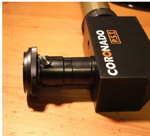
Figure 12 – Fitted to the PST

If you find that the lens is hitting the bottom of the PST eyepiece holder causing the T adaptor to be sitting up proud of the PST eyepiece holder you can cut or file a smidgen off the T adaptor, but be very careful not to make the T adaptor too short as you do need the Barlow lens as close to the bottom of the PST eyepiece holder as possible; a millimetre can make a big difference.