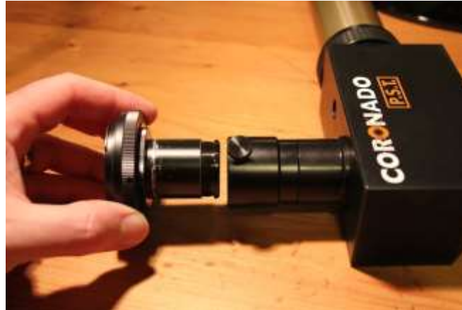
Figure 11 – The finished T adaptor on T ring

Figure 11 and Figure 12 below show how the adaptor slides all the way into the PST eyepiece holder. It is critical that the bottom of the Barlow lens is as close to the bottom of the PST eyepiece holder as possible as otherwise you will not get the back focus required. The critical dimensions are explained in the next section.